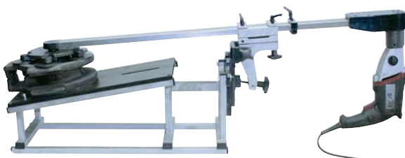
SLIM 300 grinding of gate valve wedge