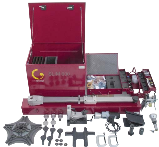
SLIM 600 Scope of delivery