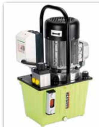
Manual Powerpacks, HAM.