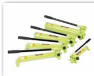
Hand Pumps, W.