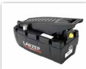
Air Hydraulic Pump Z12107.