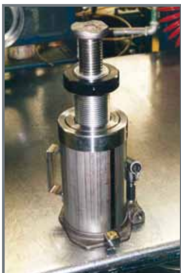
Bottle jack with lock nut