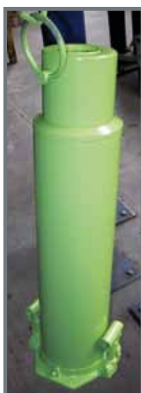
50 Tn, 2 speed, long stroke bottle jack