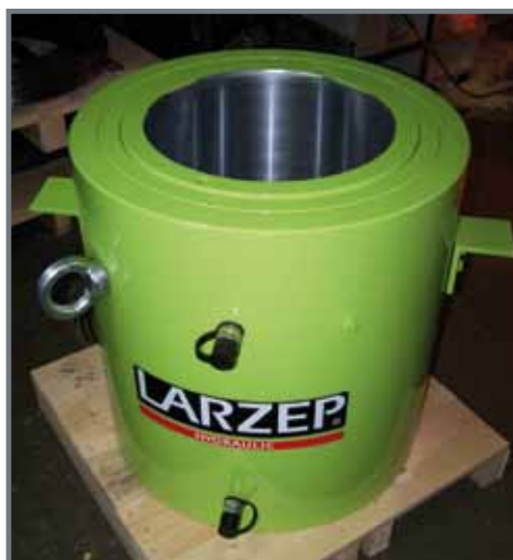
DDR200015 cylinder. 2.000 Tn capacity cylinder to place a load cell for pile testing.