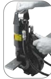
Punch Set HP20SP Includes the PE102A pump, hoses, couplers, punch and die sets in sizes 1/4", 5/16", 3/8", 7/16", and 17/32" diameter, with storage box.