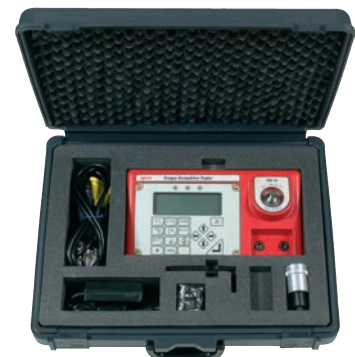
TST in standard carry case.