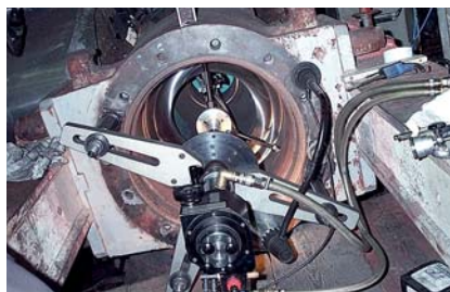
HTS 400 grinding on-site