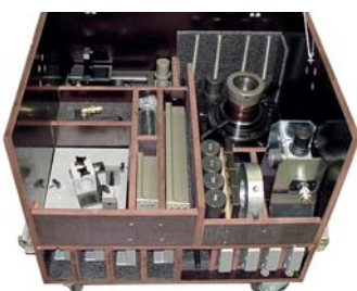
HTS transport container with accessories