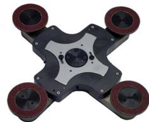
SHS 600 planet disk