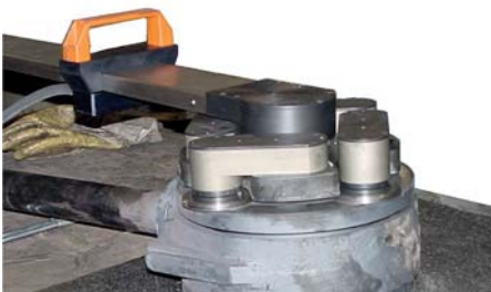
SHS 600 grinding of gate valve wedge