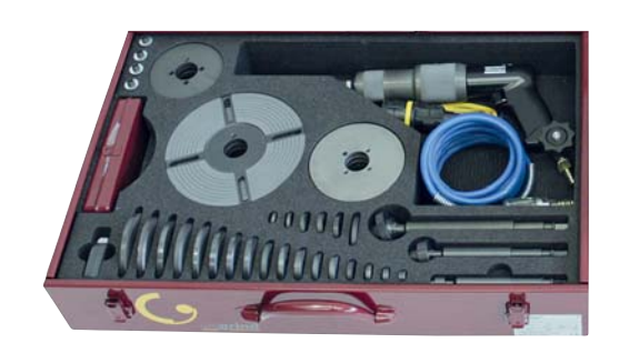
VENTA 150 transport box with grinding tools