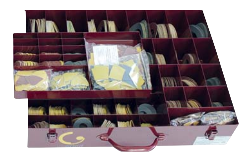
VENTA 150 transport box with abrasive set