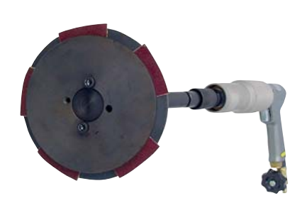
VENTA 150 drive with grinding tools

A large range of self-adhesive rings, disks and segments in quality aluminium oxide, silicon carbide and zirconium oxide available in various grits and DIAPLAN - CBN (= Cubic Boron Nitride) galvanic bonded high performance grinding heads are also available for the planet grinding disks.