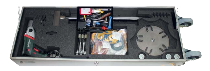
VENTA 300 transport box with accessories